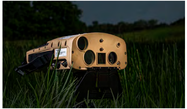
Incorporated into Marine Corp NGHTS handheld.