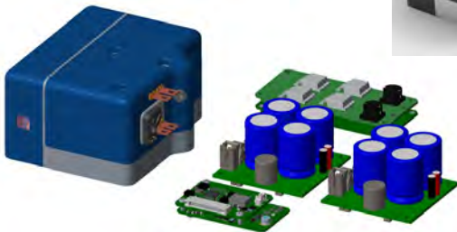
Electronics and laser cavity are at the same scale.