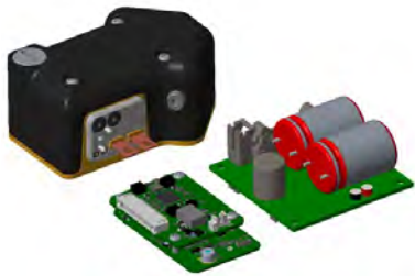
Electronics and laser cavity are at the same scale.