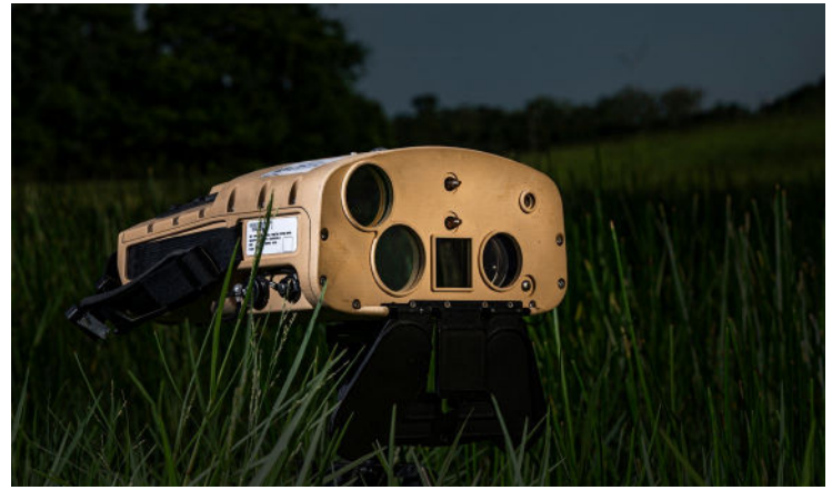
Incorporated into Marine Corp NGHTS handheld.